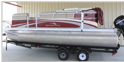
Bennington Pontoon Boat